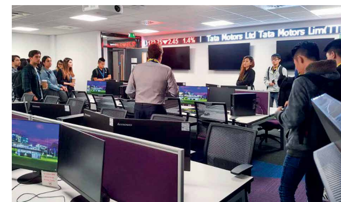
A first-hand look at the workings of the Bloomberg Financial Market Lab which services financial institutions worldwide.