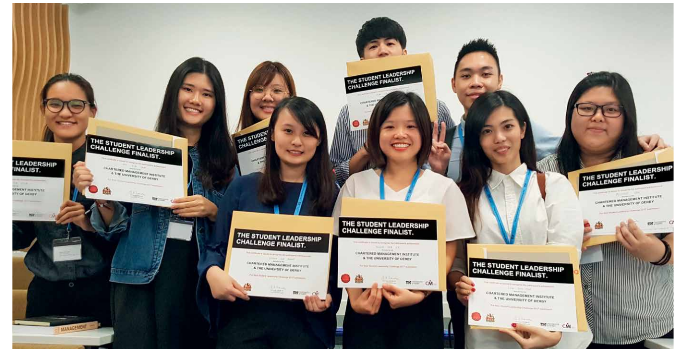
Finalists in the Chartered Management Institute–University of Derby Student Leadership Challenge programme at the University's International Summer School, UK.

At the commencement of each module, students will be provided the assessment mode and weightings for the module. Most modules have several points of assessment, which may include assignments, tests, projects and final examinations.