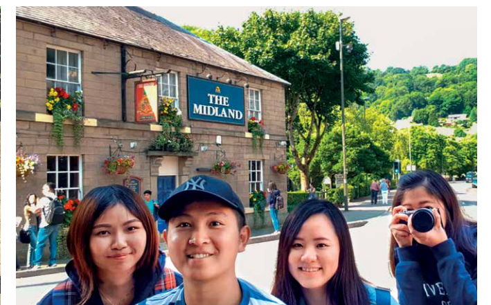
A photo after lunch at a quaint English pub (background) in Matlock Bath, Derby.