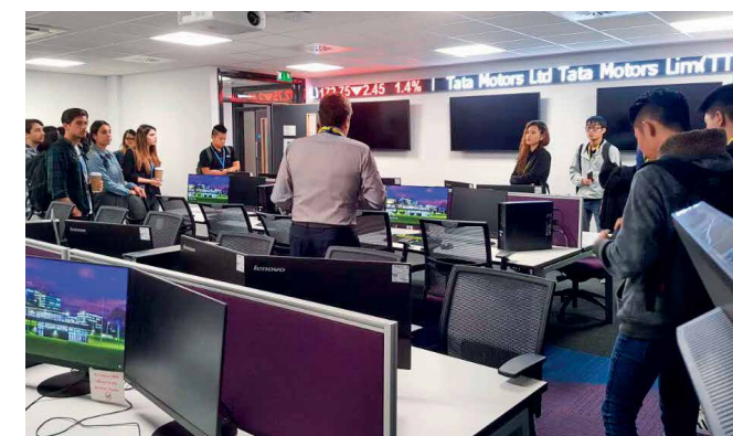
A first-hand look at the workings of the Bloomberg Financial Market Lab which services financial institutions worldwide.