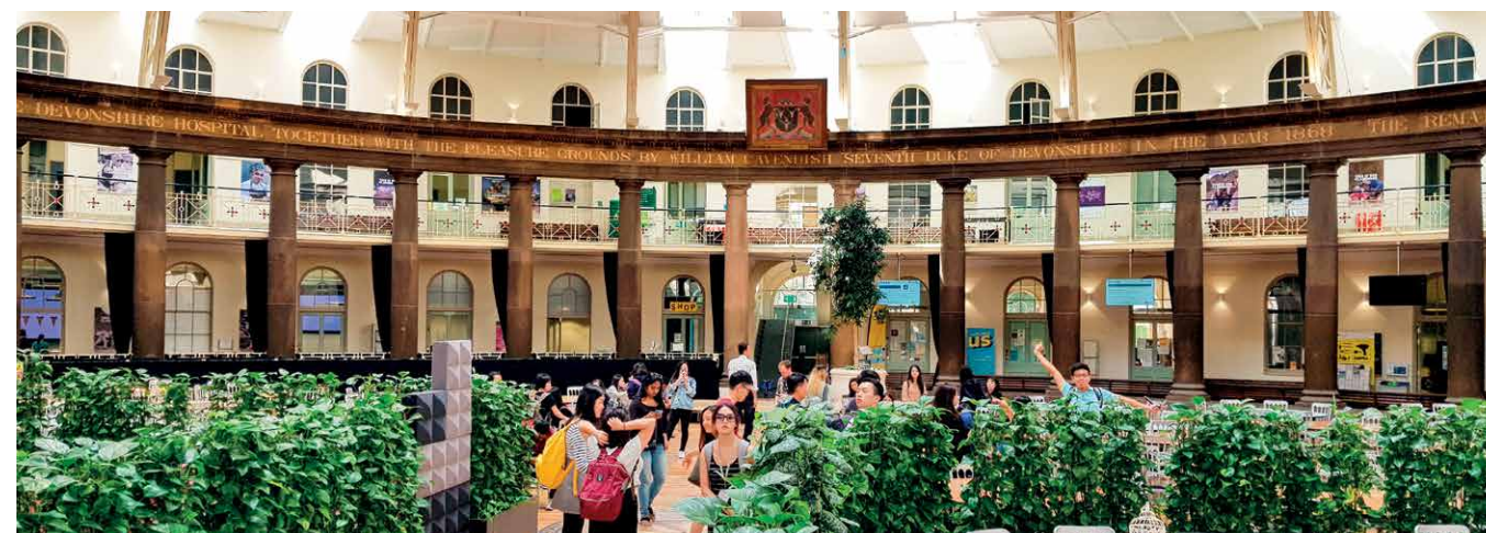
The Devonshire Dome in Buxton Campus - a stunning heritage project - now hosts the UK's premier banquets and events.