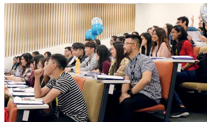
Students focusing on the welcoming brief by the University.