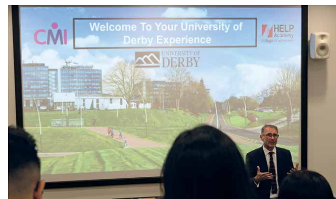
Welcoming brief by the CMI representative.