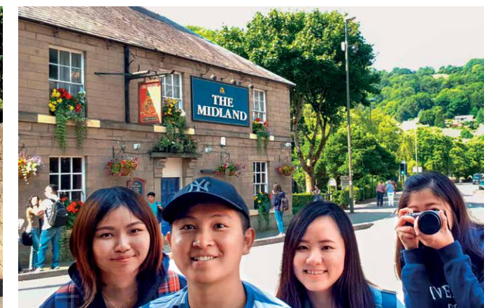
A photo after lunch at a quaint English pub (background) in Matlock Bath, Derby.