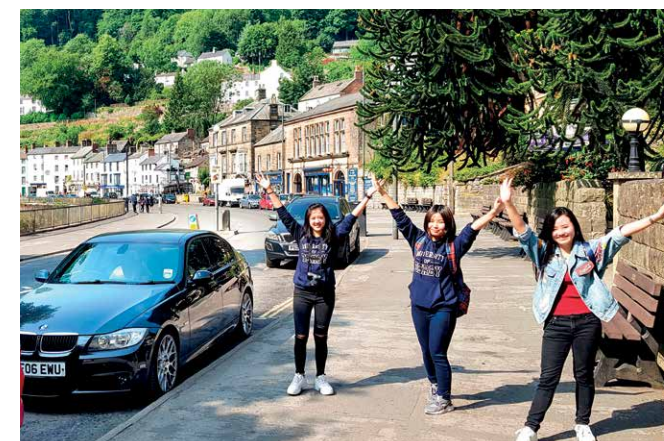
Happy to enjoy the natural beauty of Matlock Bath, Derby.