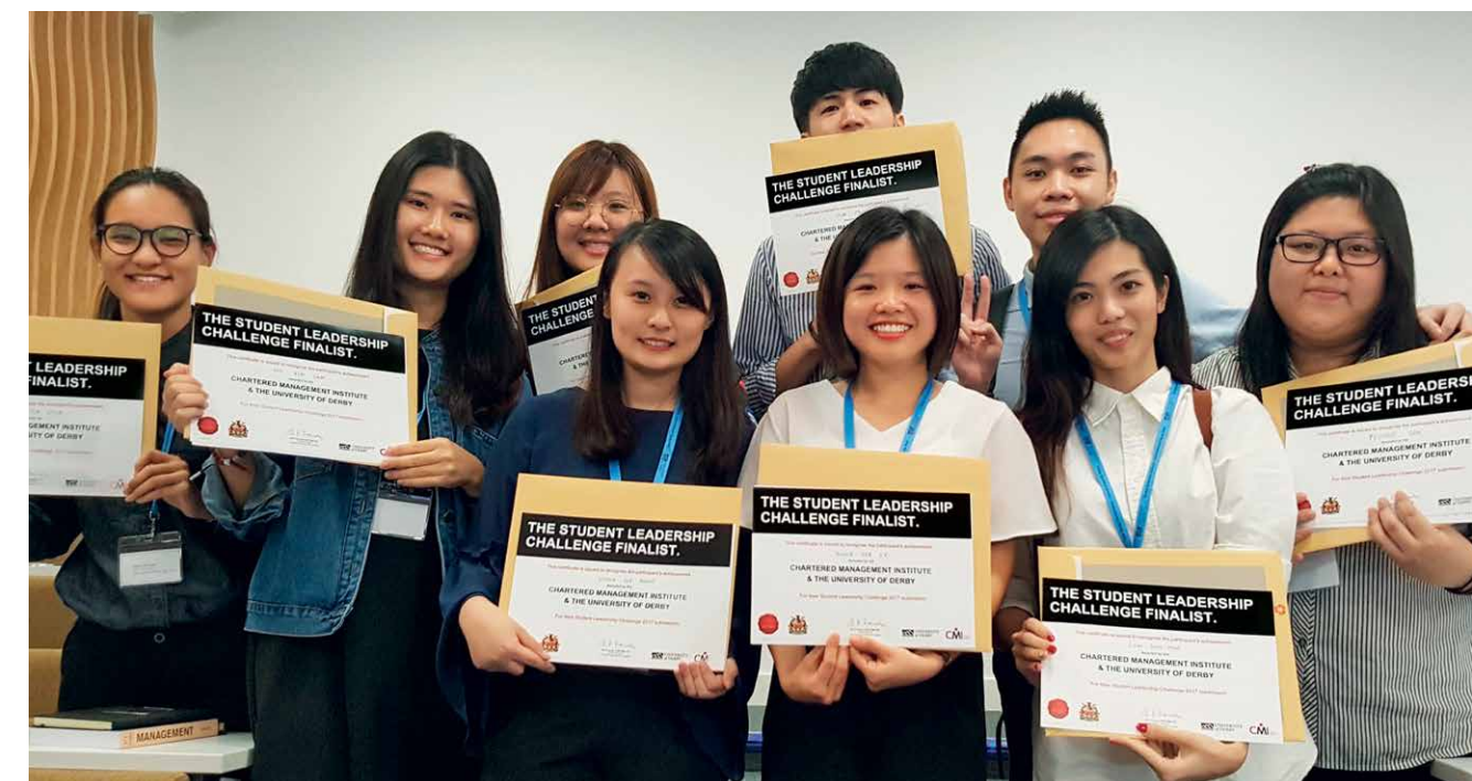
Finalists in the Chartered Management Institute-University of Derby Student Leadership Challenge programme at the University's International Summer School, UK.

*International Students ***Local Students without credit in SPM Bahasa Melayu