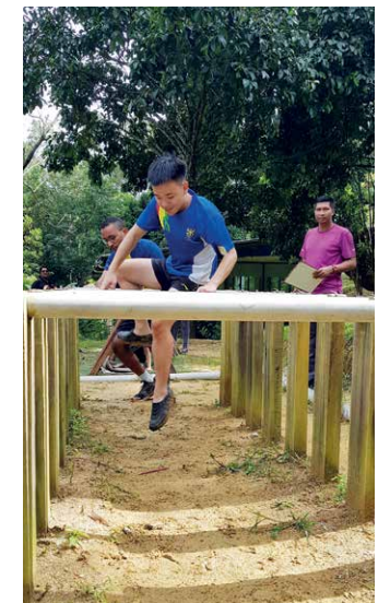
Obstacle challenges that push students to step up for themselves and face the challenge in front of them.