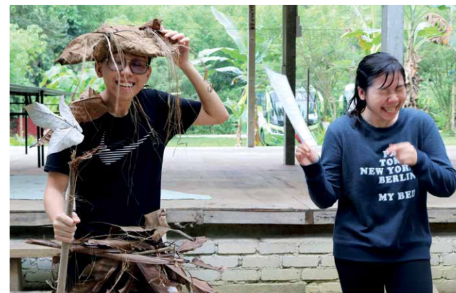
Marketing product using limited resources by DOMS students.