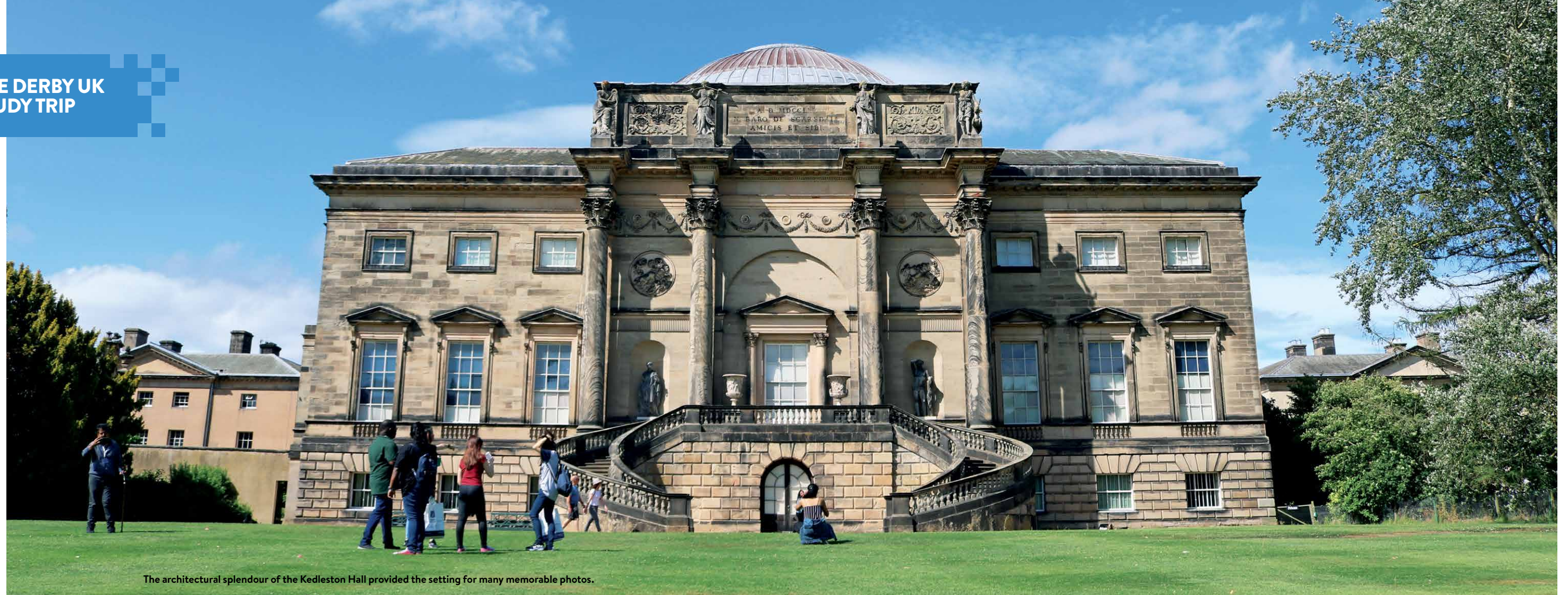
The architectural splendour of the Kedleston Hall provided the setting for many memorable photos.