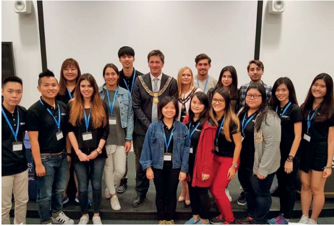
Students were given a warm welcome by the Mayor of Derby Councillor John Wiltby (centre).