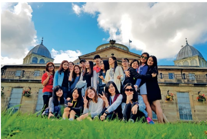
The architectural splendour of the Buxton Campus provided the setting for many memorable photos.