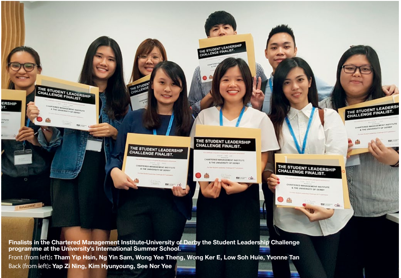
Finalists in the Chartered Management Institute-University of Derby the Student Leadership Challenge programme at the University's International Summer School.