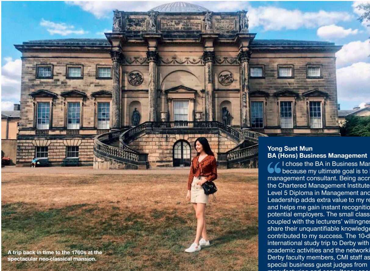
A trip back in time to the 1760s at the spectacular neo-classical mansion.