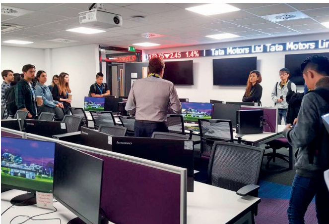
A first-hand look at the workings of the Bloomberg Financial Market Lab which services financial institutions worldwide.