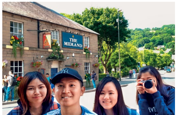
A photo after lunch at a quaint English pub (background) in Matlock Bath, Derby.