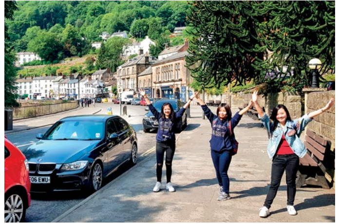
Happy to enjoy the natural beauty of Matlock Bath, Derby.