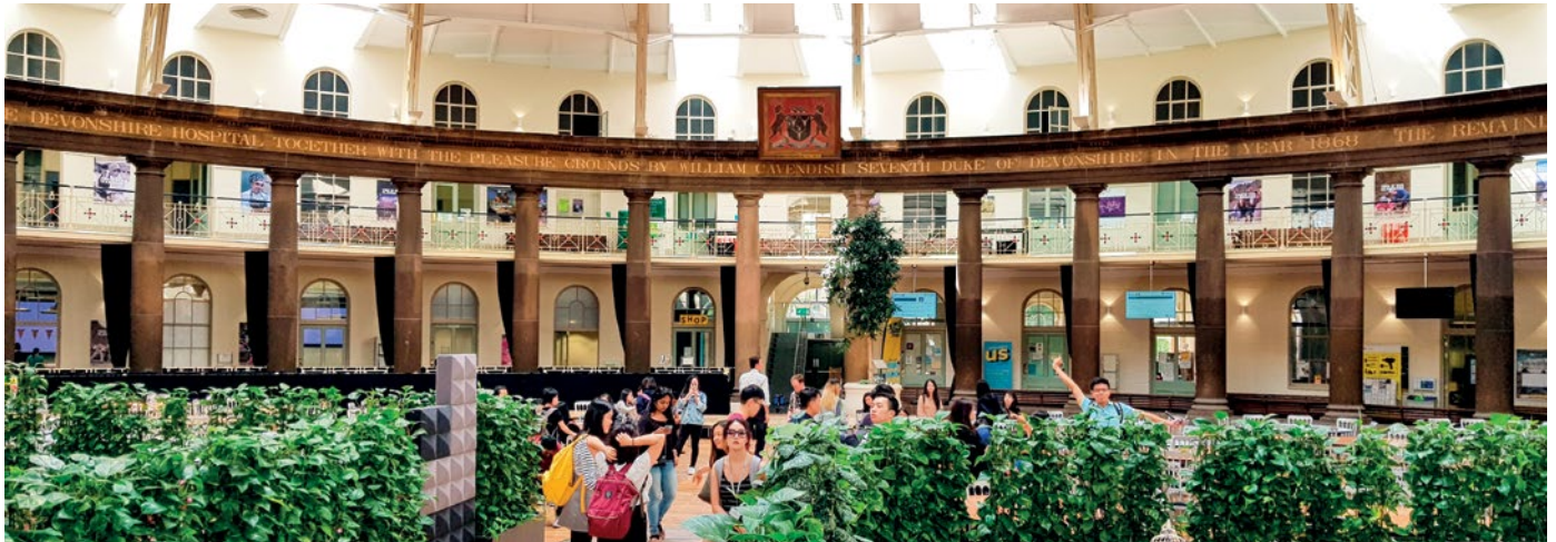
The Devonshire Dome in Buxton Campus - a stunning heritage project - now hosts the UK's premier banquets and events.