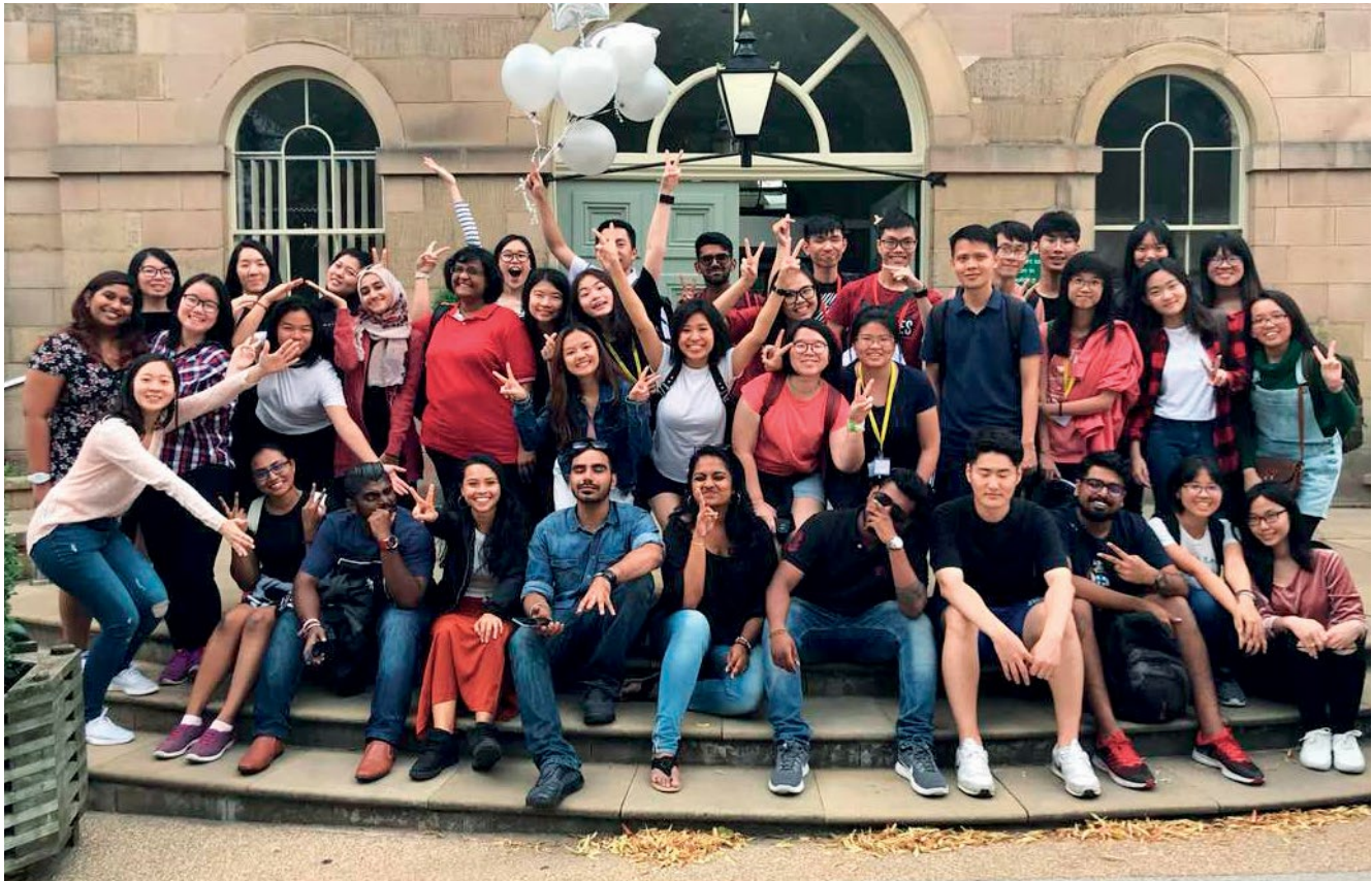
The International Study Trip to the University of Derby UK campus for HELP Academy students was organised with UOD and the Chartered Management Institute (CMI).